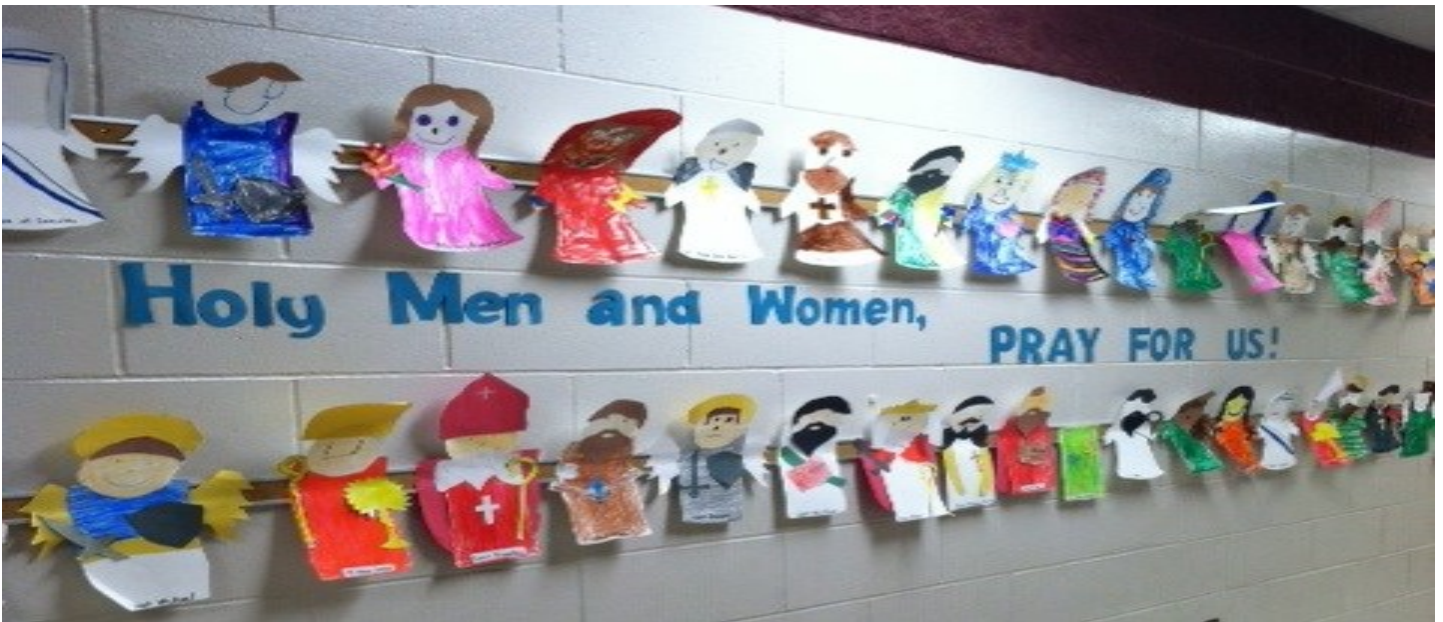
Above: Kindergarten's Saints!

Thank you for all your donations to the CSS food drive! All donations should be in by Friday, Nov 18th!