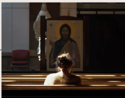
DAY TWO: 12/10 HOW TO LISTEN