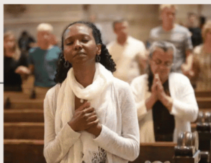
DAY ONE: 12/3 HOW TO PRAY

FIRST THREE TUESDAYS OF DECEMBER. 7PM. MULTIPURPOSE ROOM