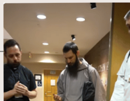
DAY THREE: 12/17 FIND YOUR PRAYER

We keep hearing, “Pray more,” or “you’ll find God in prayer.” This session is all about answering the question, “Well, how do I pray?” This session begins with the basics. Starting at square one. No need for experience.