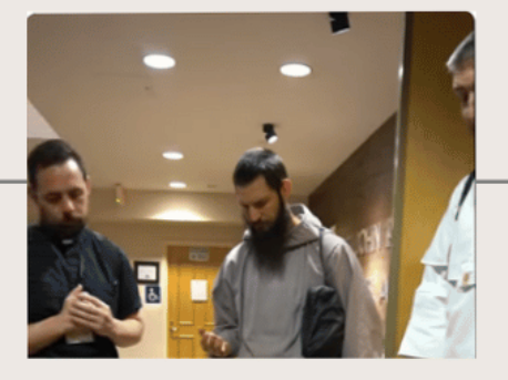
DAY THREE: 12/17 FIND YOUR PRAYER

We keep hearing, "Pray more," or "you'll find God in prayer." This session is all about answering the question, "Well, how do I pray?" This session begins with the basics. Starting at square one. No need for experience.