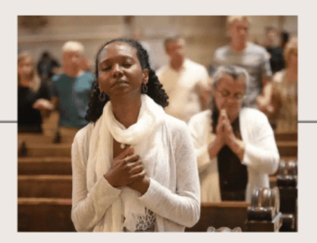
DAY ONE: 12/3 HOW TO PRAY