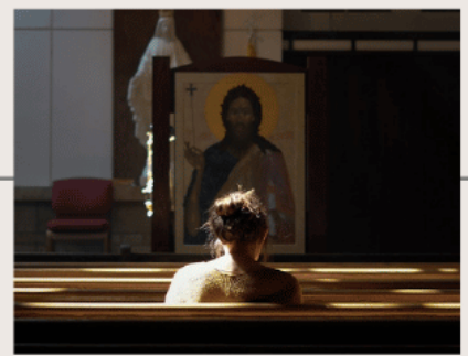
DAY TWO: 12/10 HOW TO LISTEN